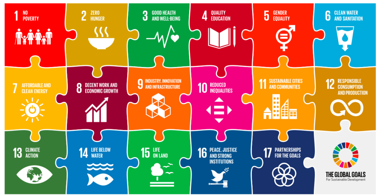
The Global Goals